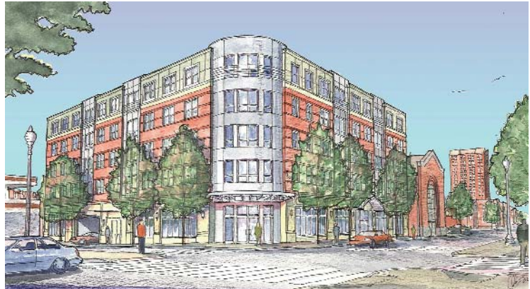
Urban Edge is developing a pioneering example of green building opportunities in affordable housing. Through an MTC grant, the non-profit will install 63 kW of solar photovoltaics at the new Egleston Crossing development in Jamaica Plain and Roxbury. This installation, in combination with multiple energy efficiency measures, will reduce the project's electricity needs by 50%.

materials, low-emitting adhesives & sealants, paints, carpets, and composite woods, and indoor chemical & pollutant source control.