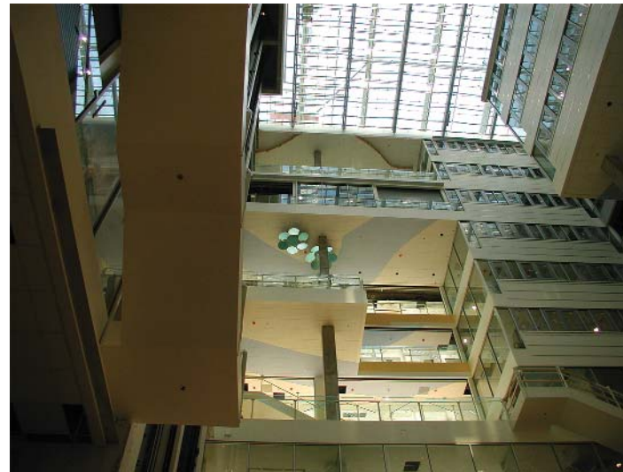
The Genzyme Corporation's recently completed office in Cambridge is a world-class example of green building construction, including advanced daylighting and thermal technologies. In addition to a photovoltaic installation funded by MTC, one of the most prominent features is a combined heliostat and reflective panel system designed to channel daylight deep into the 8-story building.

Green building energy savings primarily come from reduced electricity purchases and secondarily from reduced peak energy demand. On average, green buildings are 28% more efficient than conventional buildings and generate 2% of their power on-site from photovoltaics (PV). (See Figure 2.) The financial benefits of 30% reduced consumption at an electricity price of $0.08/kWh are about $0.30/ft 2 /yr, with a 20-year NPV of over $5/ft 2 , equal to or more than the average additional cost associated with building green.