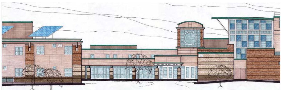
The Blackstone Valley Vocational Regional School District is planning an ambitious 80,000 square foot addition to accommodate four new vocational programs, and will renovate the existing building which has some systems that date back to the 1960's. Daylighting will be accomplished in this project by using light tube technology, which will save over 500 kW a year. Other efficiency measures include efficient air conditioning equipment and variable speed drives for the air handling unit. The school will also incorporate photovoltaic panels mounted on the roof and a solar thermal domestic water preheating system.

Given the studies and data reviewed above, the Report recommends attributing a 1% productivity and health gain to Certified and Silver level buildings and a 1.5% gain to Gold and Platinum level buildings. These percentages are at the low end of the range of productivity gains for each of the individual specific building measures—ventilation, thermal control, light control and daylighting—analyzed above. They are consistent with or well below the range of additional studies reviewed in the Report.